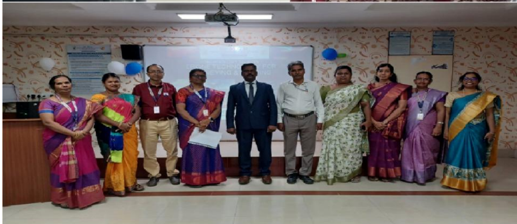
Interdisciplinary lecture on Drone technology for Surveying applications