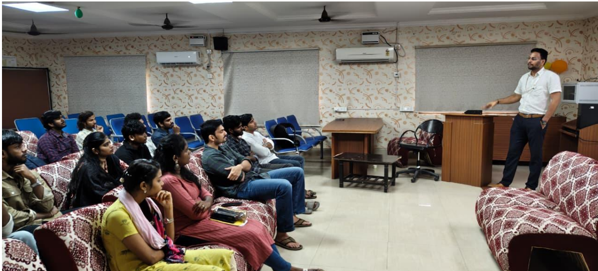
Interdisciplinary lecture on Drone technology for disaster management