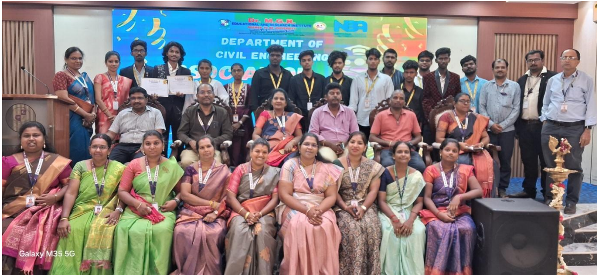
National Conference – PAALAM 2025