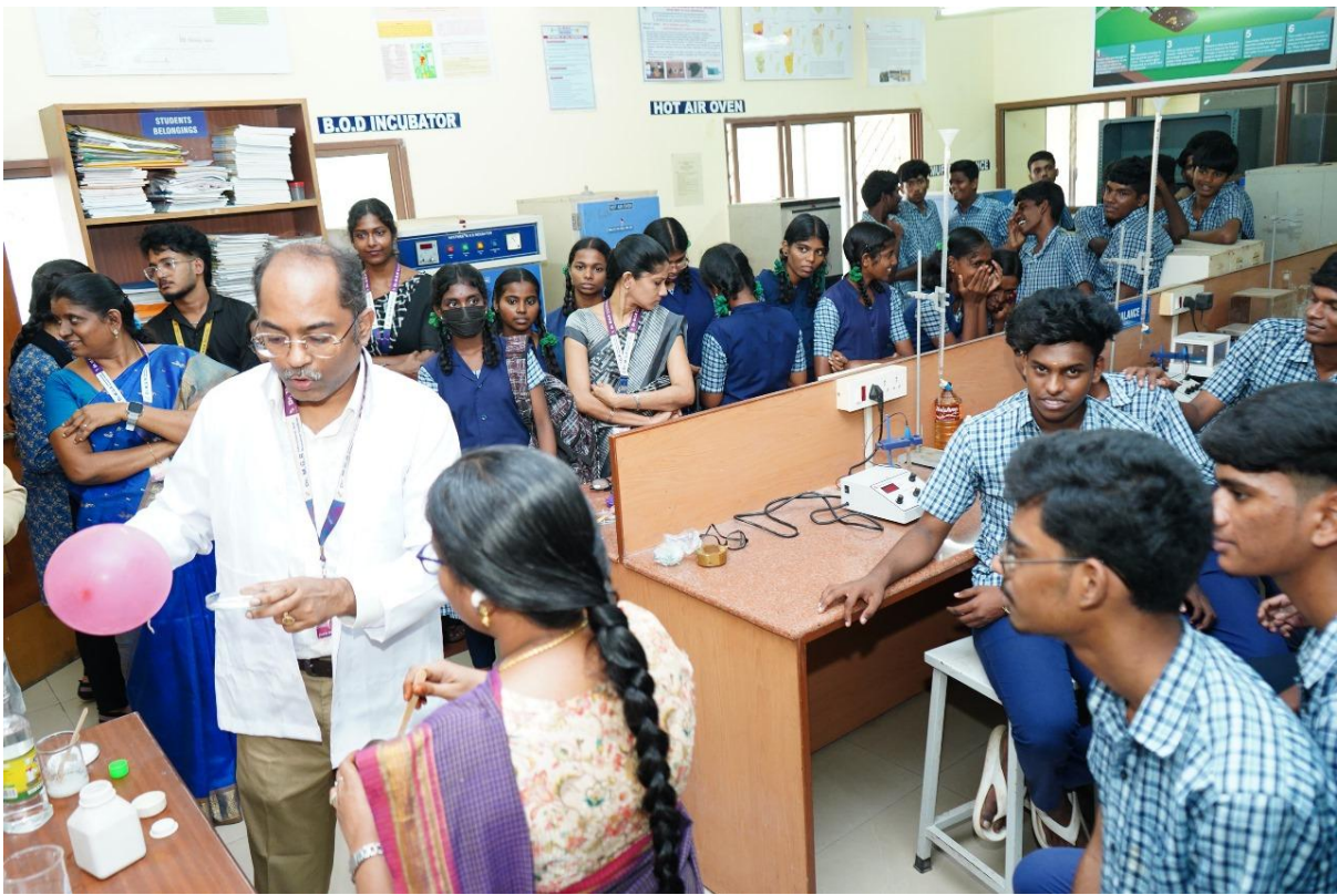
Awareness session on Civil Engineering for school students