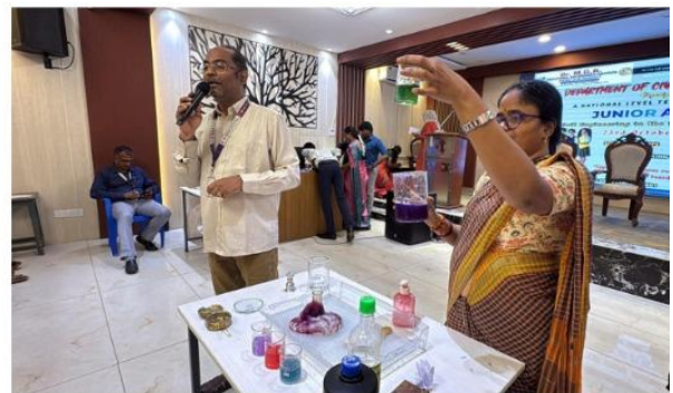
National Level Technical Symposium “AAKRITI 2025” – Day 1