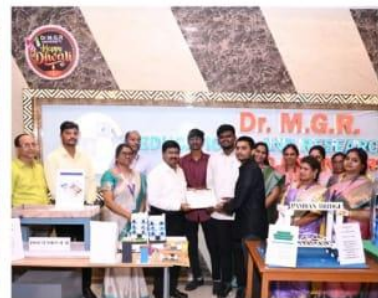
National Level Technical Symposium “AAKRITI 2025” – Appreciation from Honorable President for Model Making students