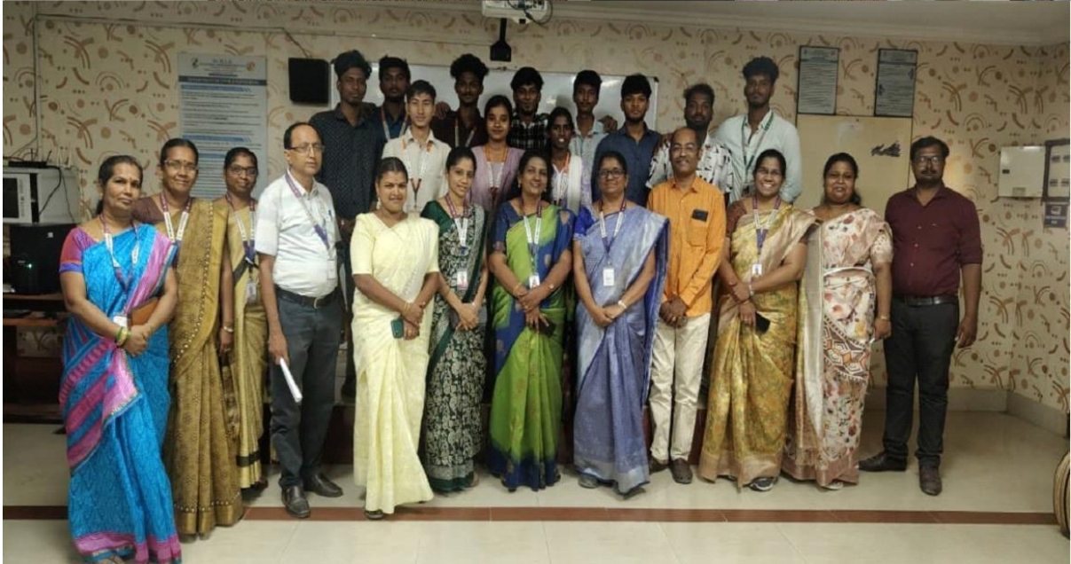
Subject lecture on Construction Management