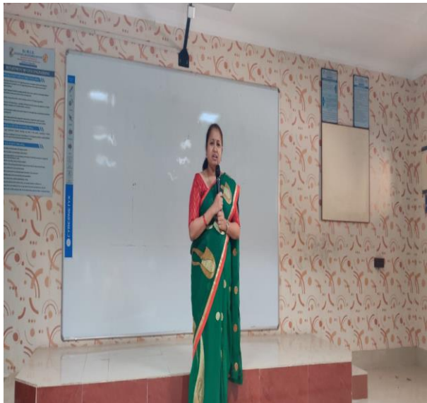
Technological talk conducted for students