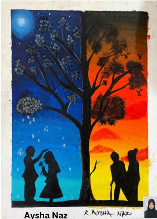
Aysha Naz 3 rdYear 'D' Section