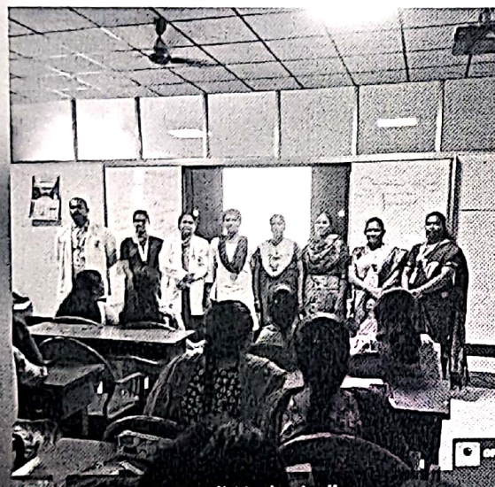
Chennai, Tamil Nadu, India

148/120, Kandasamy Nagar, Thiruverkadu, Chennai, Tamil Nadu 60 India Lat 13.05858° Long 80.13038° 20/08/2025 01:46 PM GMT +05:30