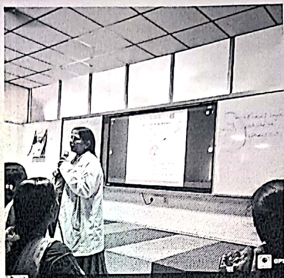
Chennai, Tamil Nadu, India

16 ,meenakshi Pancharatna Apartments,royal Castle Koparasanallu Mainroad, Chennai, Tamil Nadu 600056, India Lat 13.058253° Long 80.128149° 20/08/2025 01:52 PM GMT +05:30