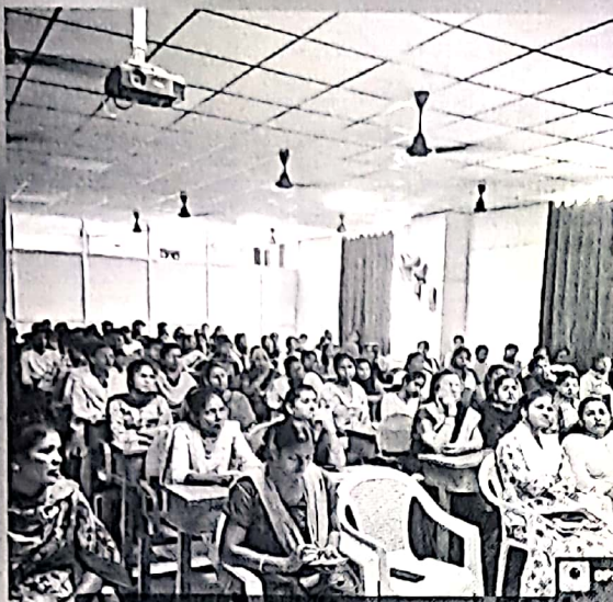
Chennai, Tamil Nadu, India

16 ,meenakshi Pancharatna Apartments,royal Castle Koparasanallu Mainroad, Chennai, Tamil Nadu 600056, India Lat 13.058253° Long 80.128149° 20/08/2025 01:52 PM GMT +05:30