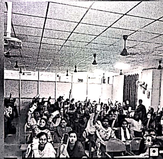
Chennai, Tamil Nadu, India

16 ,meenakshi Pancharatna Apartments,royal Castle Koparasanallu Mainroad, Chennai, Tamil Nadu 600056, India Lat 13.058413° Long 80.128401° 20/08/2025 02:59 PM GMT +05:30