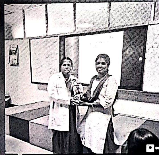
Chennai, Tamil Nadu, India

16 ,meenakshi Pancharatna Apartments,royal Castle Koparasanallu Mainroad, Chennai, Tamil Nadu 600056, India Lat 13.058424° Long 80.128392° 20/08/2025 01:48 PM GMT +05:30